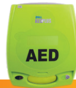
ZOLL AED PLUS®

All ZOLL AEDs are built with our proven core technology, yet each has unique features to provide solutions for public safety.